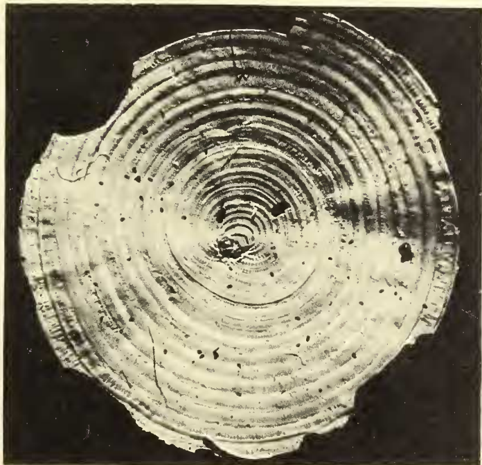
5 6 mm.